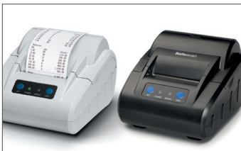
Safescan TP-230 Thermal printer Art. no: 134-0475 grey Art. no: 134-0535 black