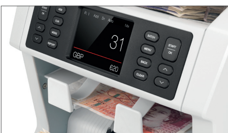
Suspected counterfeit banknotes are placed in the reject pocket