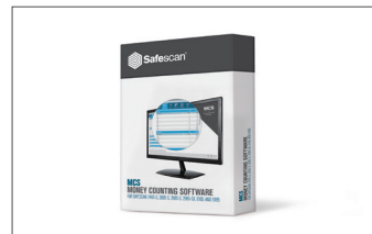
Safescan MCS Software Art. no: 124-0500