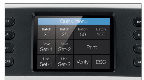
Large touch screen with quick menu and numeric keyboard