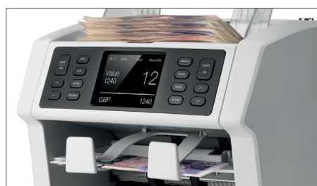
Value-mix: Counts banknotes in stacks of a preset value