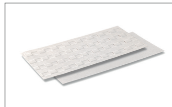
Safescan Cleaning cards Art. no: 136-0546